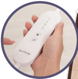
Hand-held Control Unit with 4 illuminated heat settings